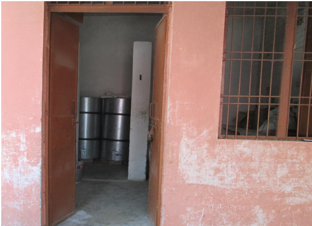
STORAGE BINS IN KITCHEN SHED OF GHS MEHAL KHURD

Safety and Hygiene: All the school kitchens have been making the best possible effort to ensure hygiene in the place where mid-day meal is prepared. In 13 schools namely GHS Kalal Majra; GHS Darat; GPS Badbar; GPS Harijan Basti-2(Tapa); GPS Bazigar Basti, Barnala; GPS(GIRLS)Sehna; GPS(BOYS)Dhanaula; GPS Bazigar Basti Cheema; GPS Ananad Pur BASTI Tapa; GMS Dhanaula Khurd; GPS Bahmania; GPS Tapa Pind and GHS Diwana ; varandhas were not clean and in the kitchen more cleanliness is required. In 72.5% of the schools, the teachers have been found to be reminding and prompting students to wash their hands before taking food. All the schools have been making deliberate efforts to serve food in an organised way. This has been done to ensure proper serving of food to all, to monitor the use of water and to ensure cleanliness and hygiene. The students are served food on their seat.