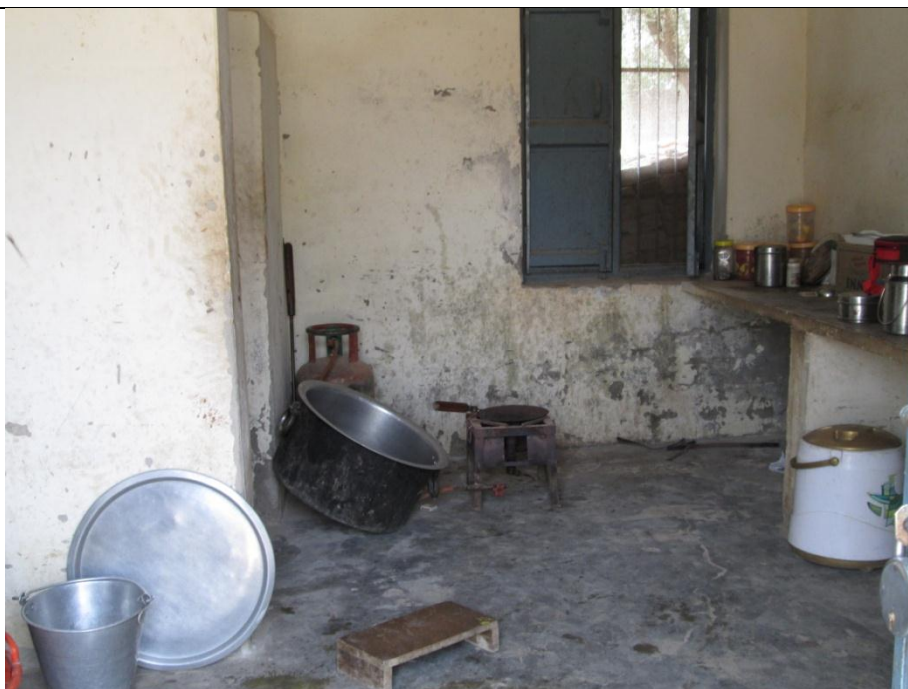
KITCHEN SHED OF GHS,NANGLA