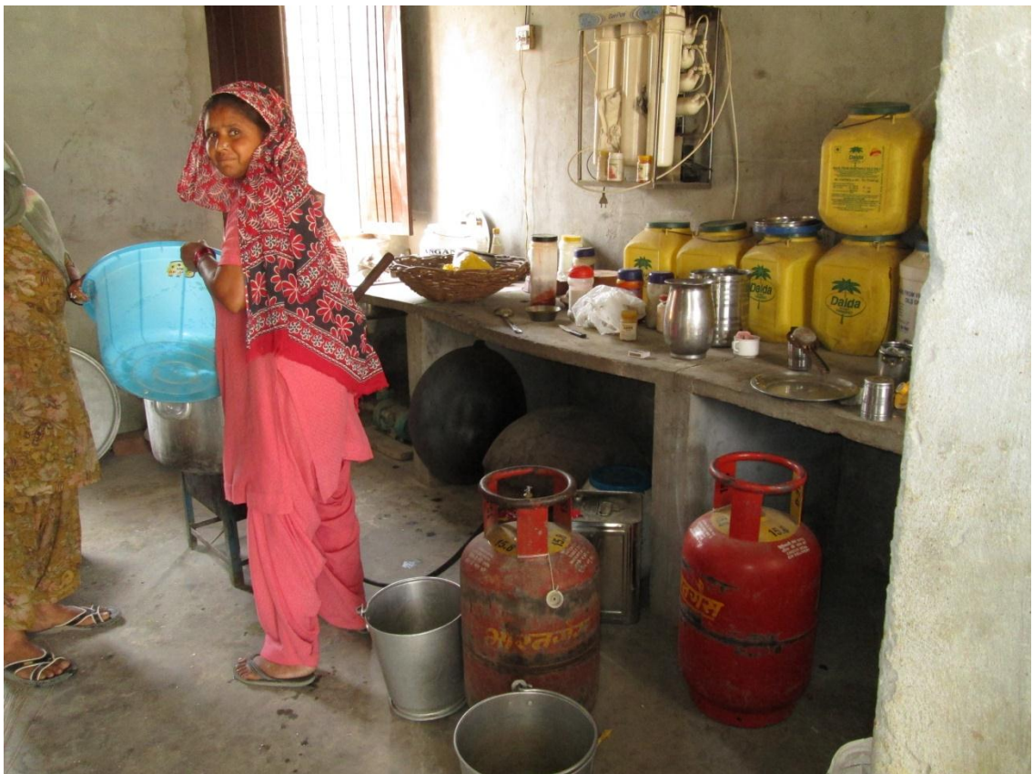
FOOD PREPARATION IN GSSS, CHANNU

* Regularity in Serving Meal : All the 40 schools in the sample serve hot cooked meal daily. There has been no interruption stated by any student or teacher. The mid-day meal is served to all the students present on all working days. Majority of the students were satisfied with the quality and quantity of food. In five school namely GPS, Kot Bhai-1; GPS, Lambi-1; GPS(Main), Lambi; GPS, Gidderbaha-II; and GMS Gobind Nagri; about 5-7% students reported that the food was sometimes more spicy and semi cooked chapattis / overcooked rice were served but that was not a routine.