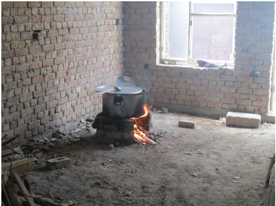
INCOMPLETE KITCHEN SHED OF GPS GIDDERBAHA - I