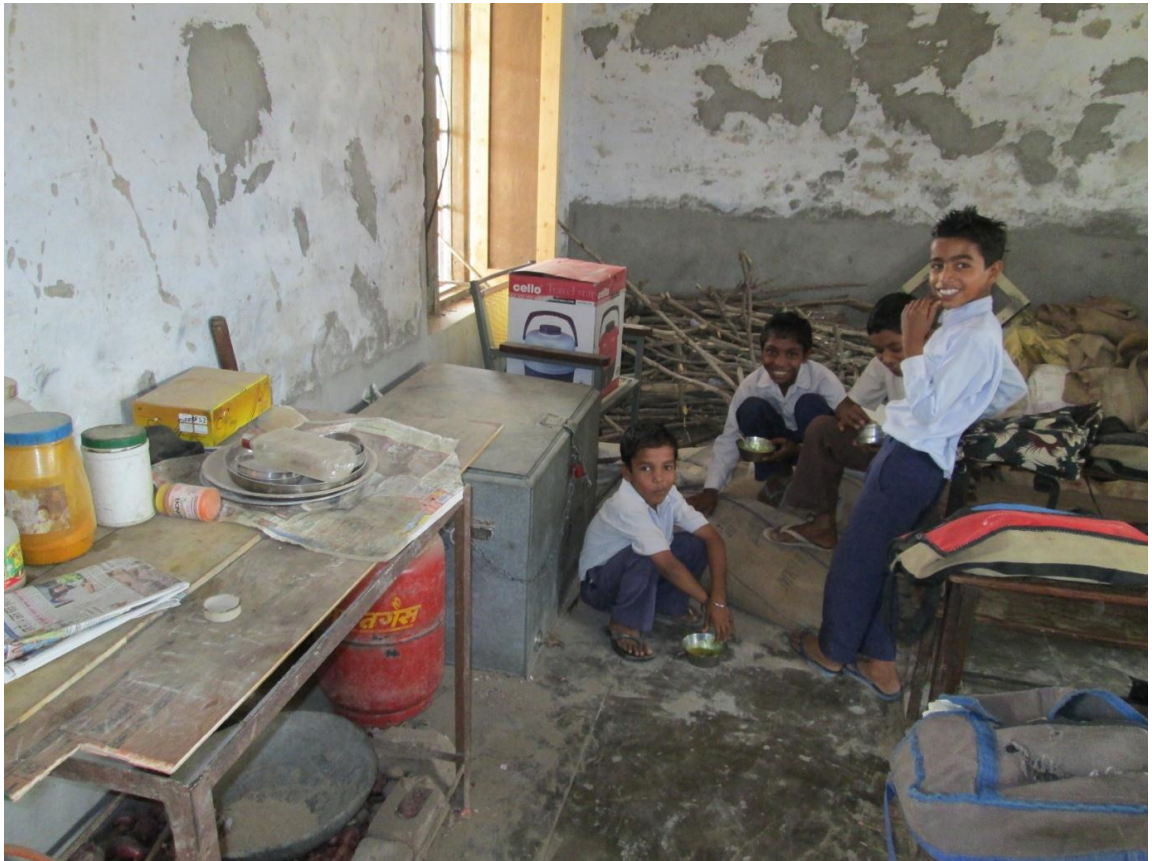
INNER VIEW OF KITCHEN SHED OF GPS GURUSAR

Safety and Hygiene: All the school kitchens have been making the best possible effort to ensure hygiene in the place where mid-day meal is prepared. In 7 schools namely GPS, Kot Bhai-1; GPS, Kothe Kotbhai-1; GPS, Fakarsar; GPS,Lambi-1; GPS(Main), Lambi; GMS Gobind Nagri; and GPS,Gurusar varandhas were not clean and in the kitchen more cleanliness is required. In 72.5% of the schools, the teachers have been found to be reminding and prompting students to wash their hands before taking food. All the schools have been making deliberate efforts to serve food in an organised way. This has been done to ensure proper serving of food to all, to monitor the use of water and to ensure cleanliness and hygiene. The students are served food on their seat.