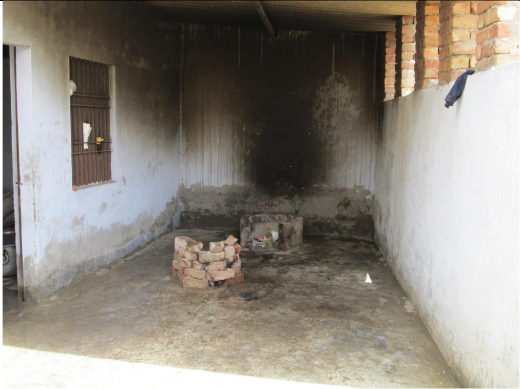
KITCHEN SHED VARANDHA IN GPS GIDDERBAHA 2