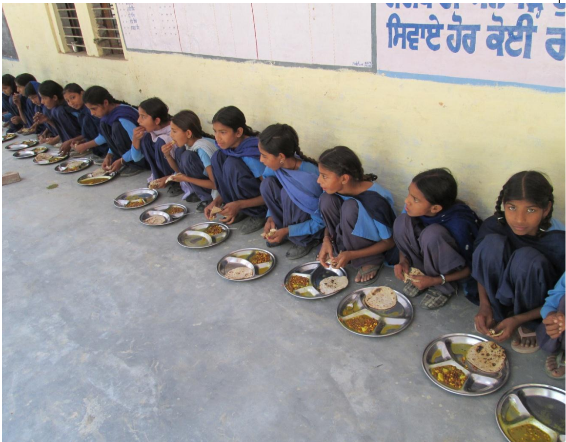
STUDENTS HAVING MDM IN GSSS, SEHNA

Social Equity: In all the 40 schools, there is no social discrimination in serving mid-day meal. Some of the possible factors of discrimination like caste, gender or community have not been influencing MDM at any stage in the process of its implementation. It has been observed that in all of the schools children are served mid-day meal in a systematic manner in the varandhas. It is observed that students belonging to higher primary classes helped in serving and distributing mid-day meal to primary class students. In majority of the schools (80%), all children used to take their meal in the varandhas, in 20% schools, some students sit in varandhas and some inside their respective classrooms.