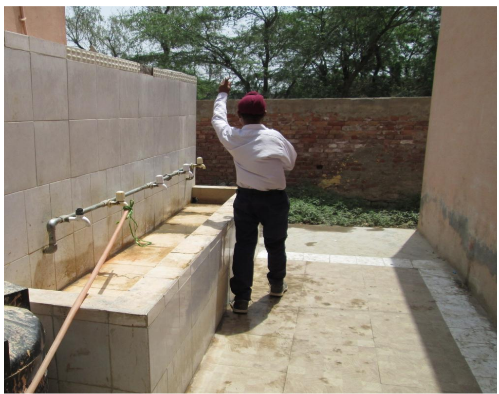
DRINKING WATER ARRANGEMENT

* Drinking water: The availability of water has been confirmed in all the 40 schools. The quality and quantity of water has been found to be good for purpose of cooking and drinking in 25 schools; but in 15 schools namely GPS, Mansa Village; GPS Samao; GHS Ralla; GPS, Akalia (EGS); GPS, Moosa; GMS, Khivan Kalan; GMS, Maghanian; GMS, Bareta Village; GPS, Bhai Desa; GPS (G), Joga; GMS, Bajewala; GPS (B), Sardulgarh; GHS, Moffar; GSSS, Bhikhi; and GSSS, Kusla , the ground water is either heavy or too much salty.