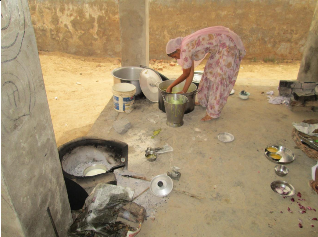
FOOD PREPARATION ON FIREWOOD IN GPS GURUSAR